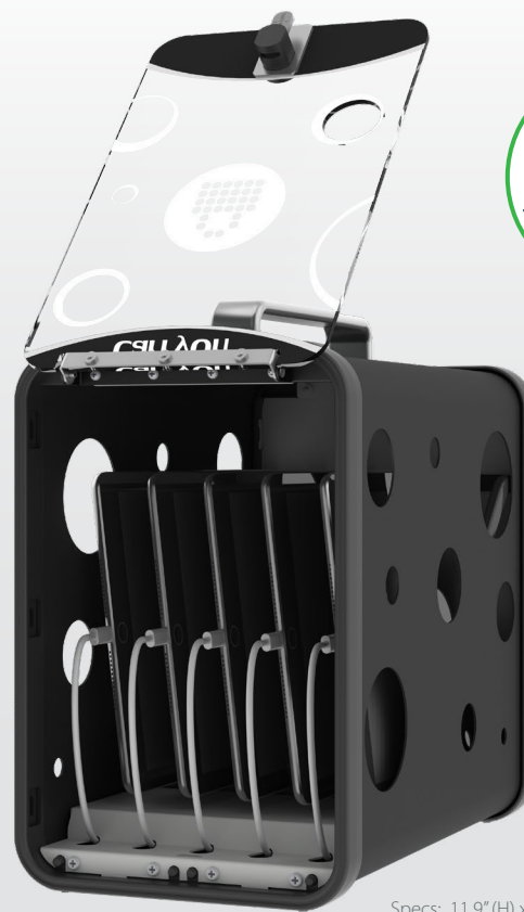
Specs: 11.9"(H) x 7.2"(W) x 12.3"(L) | 5.5 lbs